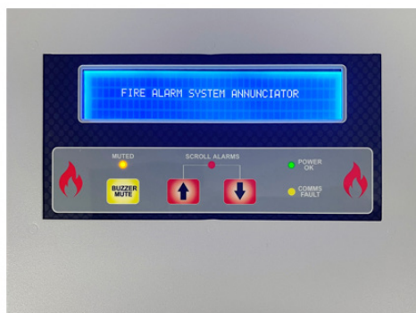
Remote Display Annunciator

An 8 x 2 LCD display is provided to give visual indications of the overall system status and details of any faults.